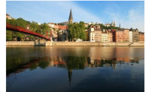
Lyon- Unesco World Heritage City